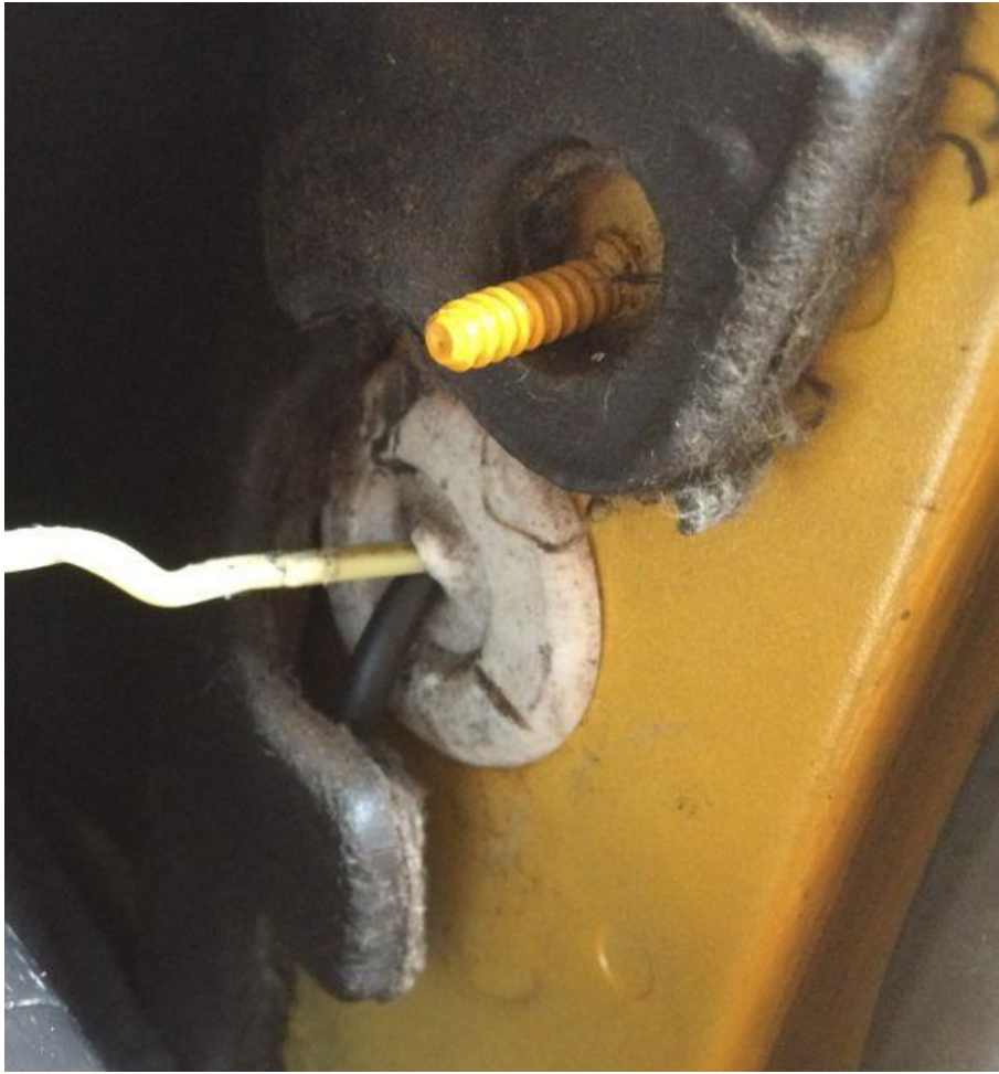
Pinched a 36 buzzer from a Golf